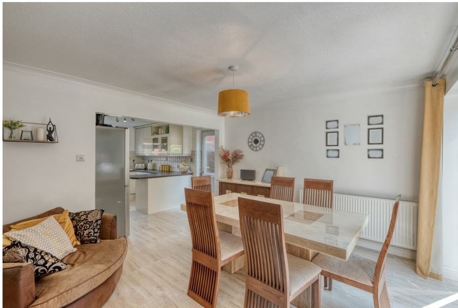
Ashperton Close, Redditch